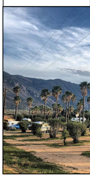
RSM RV PARK

Looking for a place to host your next retreat, conference or camp? Consider coming to RSM in the beautiful Guadalupe Valley, where we have all the amenities to host you and your group. Check out our website for more details or contact us!